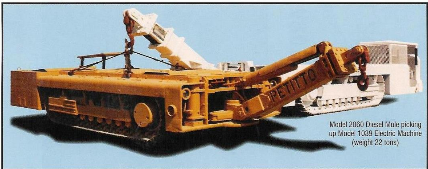
Model 2060 Diesel Mule picking up Model 1039 Electric Machine (weight 22 tons)

Four (4) Stab Jacks Two (2) Rib Jacks Particulate Emission Filter Automatic Fire Suppression System MSHA Part 36 Approved Certified Canopy Assembly Centralized Boom Lubrication